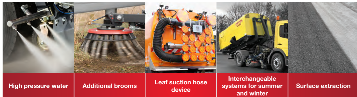
High pressure water

Thanks to our modular system, your machine becomes an unbeatable cleaning professional. Here you will find a small selection of possibilities: